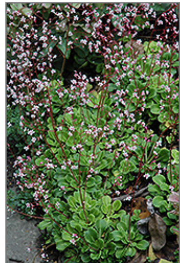
London Pride in bloom

London Pride is recommended for the following landscape applications;