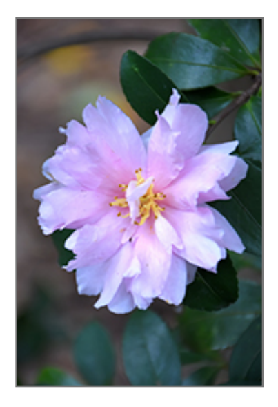
Jean May Camellia flowers