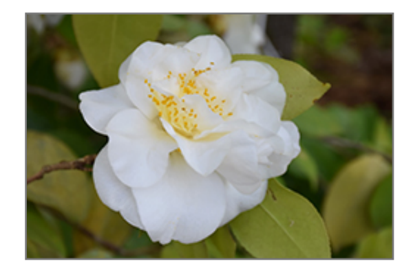
White Doves Camellia flowers