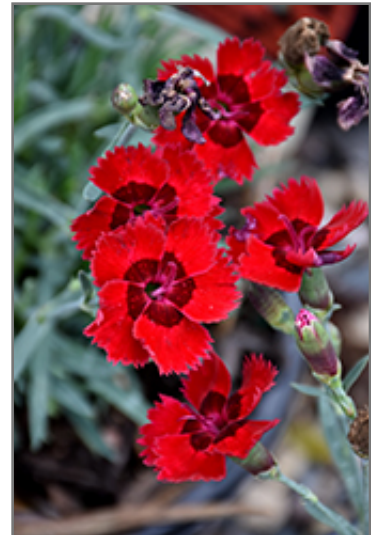
Fire Star Pinks flowers

Fire Star Pinks is recommended for the following landscape applications;