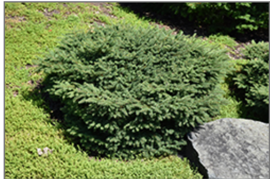
Birds Nest Spruce