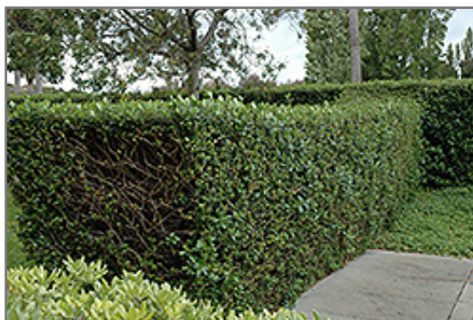
Red Escallonia