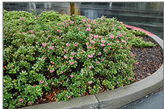
Newport Dwarf Escallonia in bloom