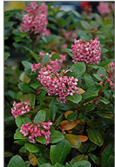
Newport Dwarf Escallonia flowers

This is a relatively low maintenance shrub, and should not require much pruning, except when necessary, such as to remove dieback. It is a good choice for attracting birds and butterflies to your yard. It has no significant negative characteristics.