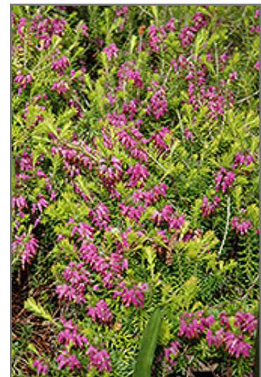
Myretoun Ruby Heath flowers