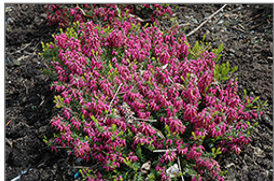
Tanja Heath in bloom