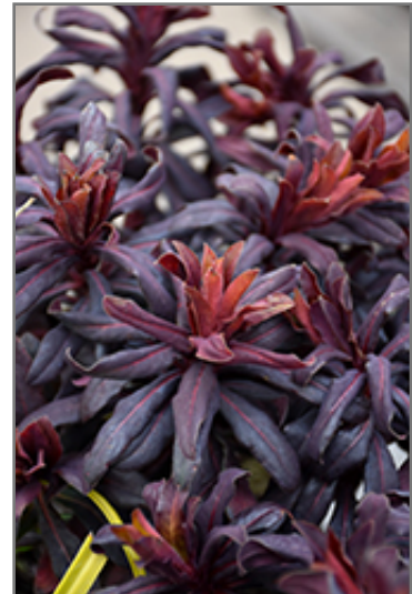
Ruby Glow Wood Spurge flowers

Ruby Glow Wood Spurge is an herbaceous perennial with a mounded form. Its medium texture blends into the garden, but can always be balanced by a couple of finer or coarser plants for an effective composition.