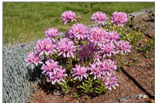
Orchid Lights Azalea in bloom