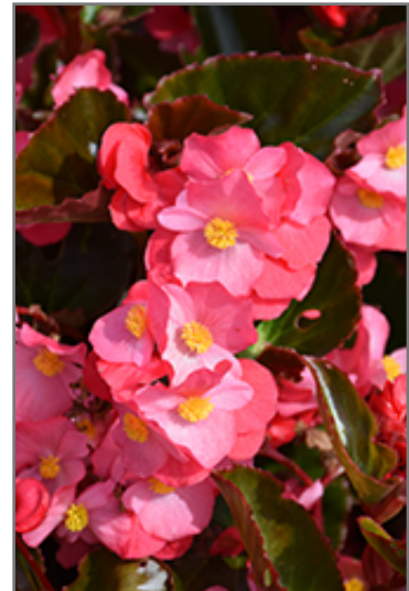
Big Rose Bronze Leaf Begonia flowers