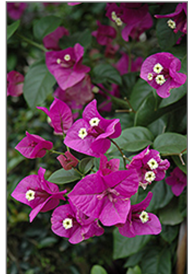
Purple Queen Bougainvillea flowers