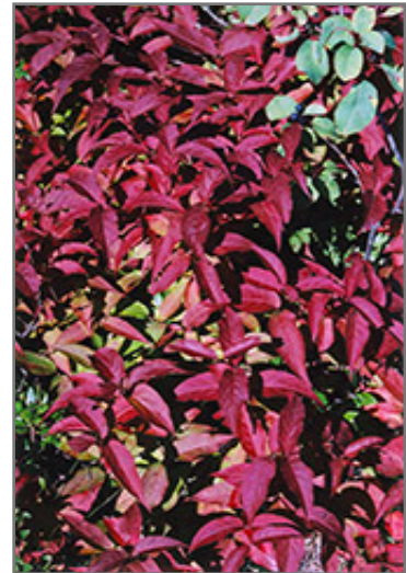
Bush Honeysuckle in fall

* This is a 'special order' plant - contact store for details