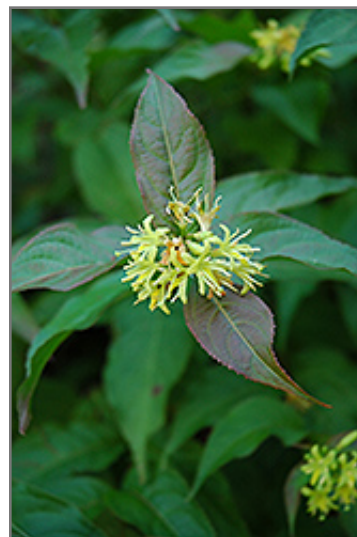
Bush Honeysuckle flowers