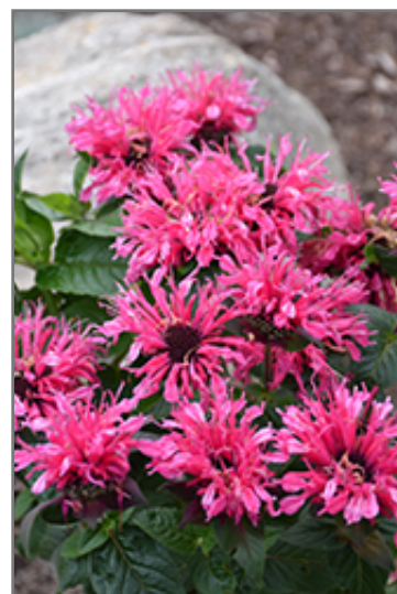
Cranberry Lace Beebalm flowers