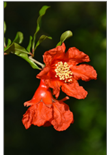
Pomegranate flowers