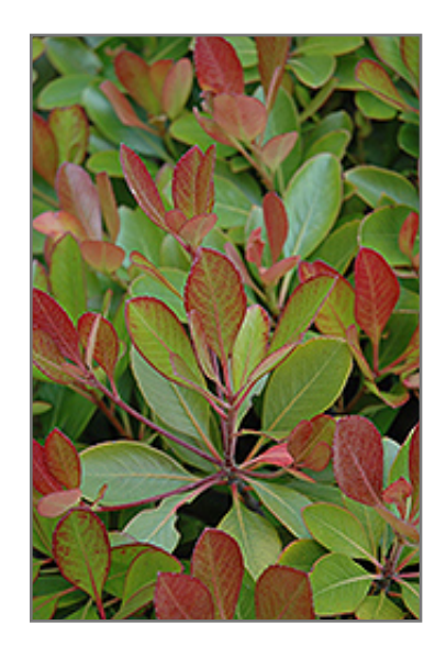
Indian Hawthorn foliage