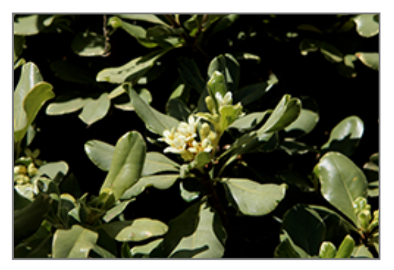
Indian Hawthorn flowers

This shrub does best in full sun to partial shade. It prefers to grow in average to moist conditions, and shouldn't be allowed to dry out. It is not particular as to soil type or pH. It is somewhat tolerant of urban pollution. This species is not originally from North America.