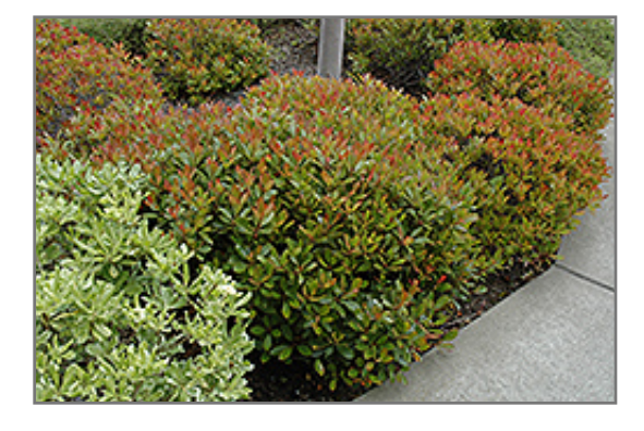
Indian Hawthorn

This is a relatively low maintenance shrub, and should only be pruned after flowering to avoid removing any of the current season's flowers. It is a good choice for attracting birds to your yard. Gardeners should be aware of the following characteristic(s) that may warrant special consideration;