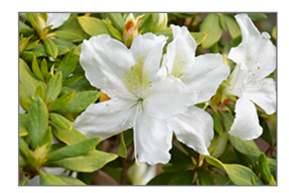
Bloom-A-Thon White Azalea flowers