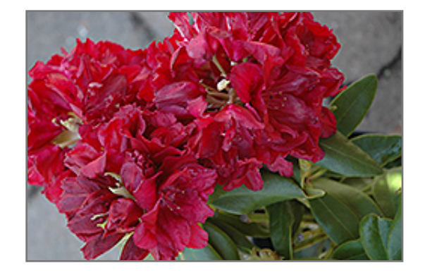
Double Besse Rhododendron flowers

Double Besse Rhododendron will grow to be about 4 feet tall at maturity, with a spread of 4 feet. It tends to be a little leggy, with a typical clearance of 1 foot from the ground. It grows at a slow rate, and under ideal conditions can be expected to live for 40 years or more.