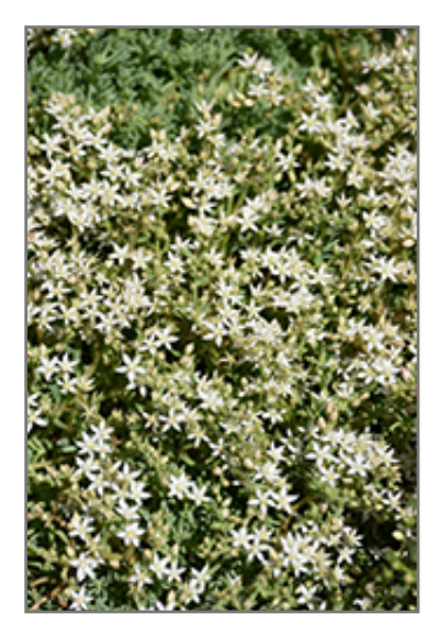
Dwarf Spanish Stonecrop flowers