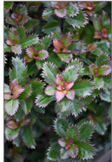
Sallywag Holly foliage