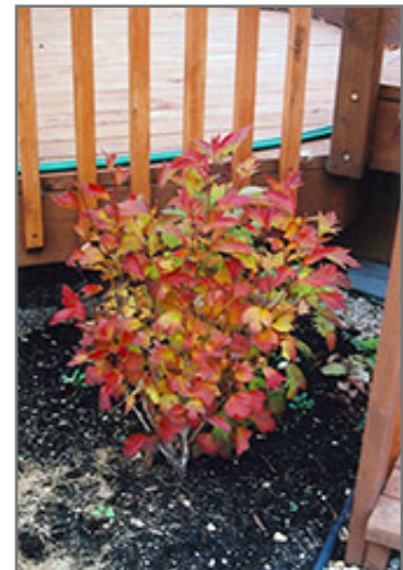
Compact Highbush Cranberry in fall