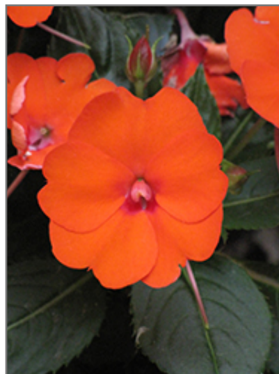
SunPatiens Compact Electric Orange New Guinea Impatiens flowers

SunPatiens Compact Electric Orange New Guinea Impatiens is a dense herbaceous annual with a mounded form. Its medium texture blends into the garden, but can always be balanced by a couple of finer or coarser plants for an effective composition.