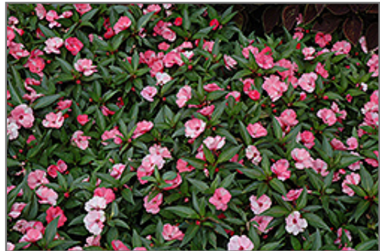
SunPatiens Spreading Pink Flash New Guinea Impatiens in bloom