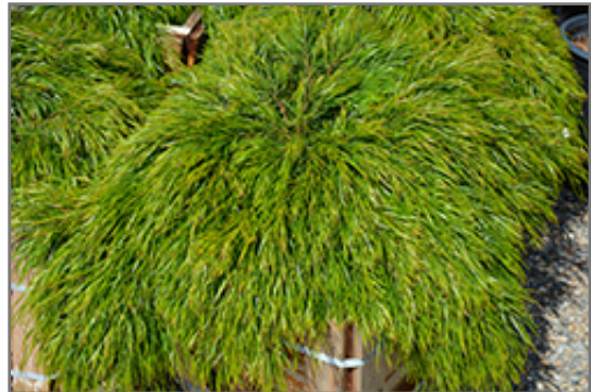
Cousin Itt Little River Wattle

Cousin Itt Little River Wattle is recommended for the following landscape applications;