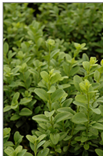
Julia Jane Boxwood foliage