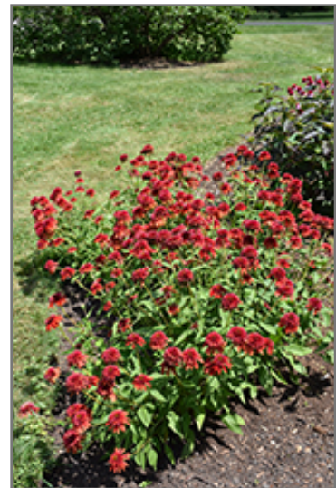
Double Scoop Orangeberry Coneflower in bloom