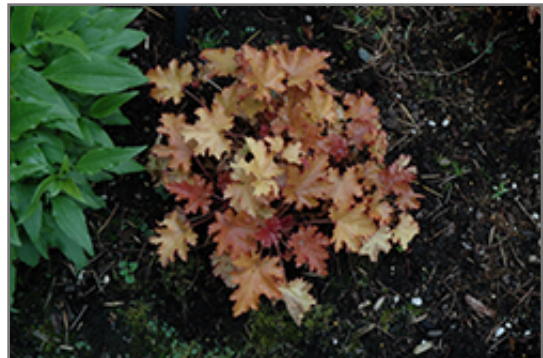
Zipper Coral Bells