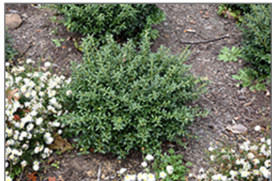
Soft Touch Japanese Holly