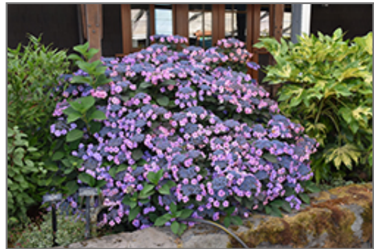
Tuff Stuff Hydrangea in bloom