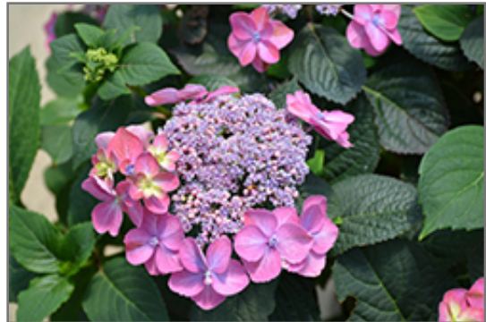
Tuff Stuff Hydrangea flowers

* This is a 'special order' plant - contact store for details