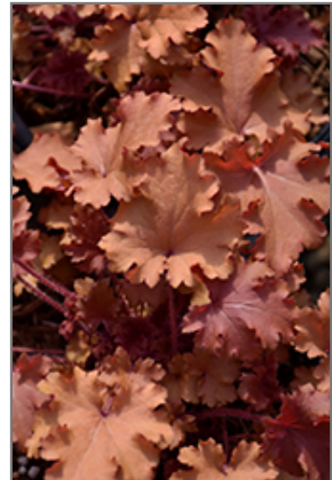
Peach Crisp Coral Bells foliage

Peach Crisp Coral Bells will grow to be about 14 inches tall at maturity extending to 20 inches tall with the flowers, with a spread of 18 inches. When grown in masses or used as a bedding plant, individual plants should be spaced approximately 15 inches apart. Its foliage tends to remain dense right to the ground, not requiring facer plants in front. It grows at a medium rate, and under ideal conditions can be expected to live for approximately 10 years. As an evergreen perennial, this plant will typically keep its form and foliage year-round.