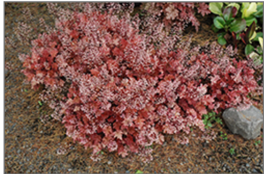
Peach Crisp Coral Bells in bloom

This is a relatively low maintenance plant, and should be cut back in late fall in preparation for winter. It is a good choice for attracting hummingbirds to your yard. It has no significant negative characteristics.