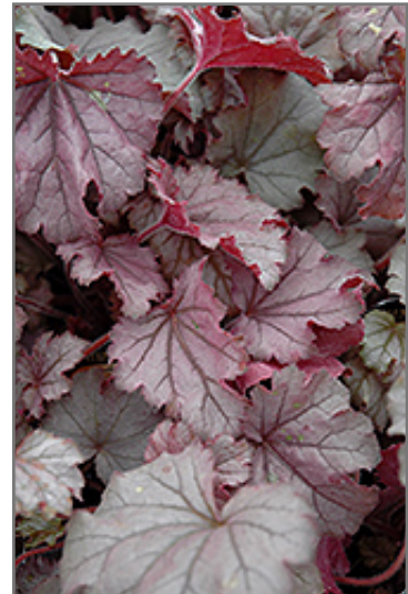
Little Cuties Sugar Berry Coral Bells foliage

This is a relatively low maintenance plant, and should be cut back in late fall in preparation for winter. It is a good choice for attracting hummingbirds to your yard. It has no significant negative characteristics.