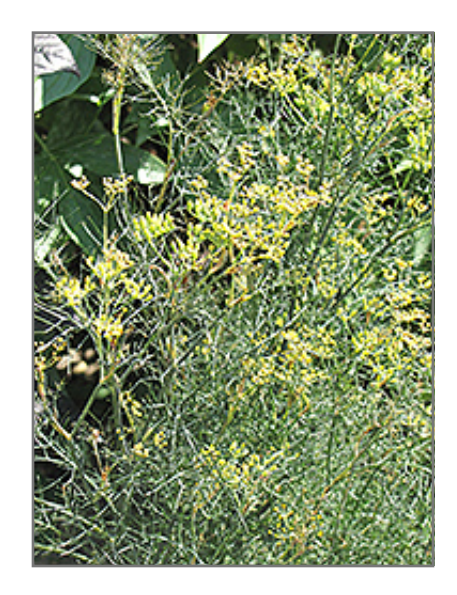
Bronze Fennel in bloom