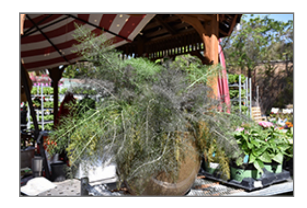
Bronze Fennel

Bronze Fennel has masses of beautiful yellow flat-top flowers held atop the stems in mid summer, which are most effective when planted in groupings. The flowers are excellent for cutting. Its attractive fragrant ferny leaves emerge burgundy in spring, turning bluish-green in color with showy coppery-bronze variegation and tinges of purple throughout the season.