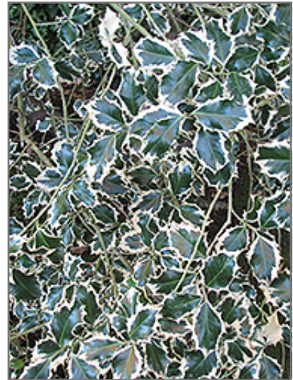
Variegated English Holly foliage