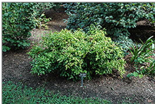
Wood's Dwarf Nandina

Wood's Dwarf Nandina is recommended for the following landscape applications;