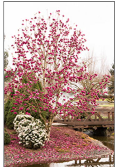
Black Tulip Magnolia in bloom