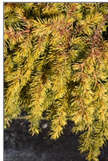
All Gold Shore Juniper foliage