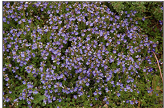
Turkish Speedwell in bloom

Turkish Speedwell is a dense herbaceous perennial with a ground-hugging habit of growth. It brings an extremely fine and delicate texture to the garden composition and should be used to full effect.