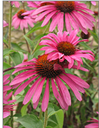
Ruby Star Coneflower flowers

Ruby Star Coneflower is recommended for the following landscape applications;