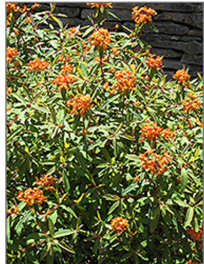
Fireglow Spurge in bloom