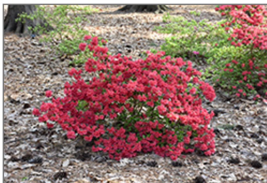
Girard's Crimson Azalea in bloom