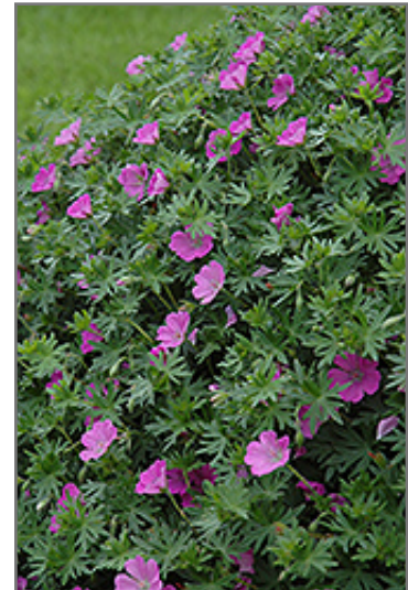
Bloody Cranesbill flowers

Bloody Cranesbill is a dense herbaceous perennial with a mounded form. It brings an extremely fine and delicate texture to the garden composition and should be used to full effect.