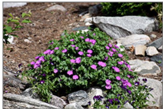
Bloody Cranesbill in bloom