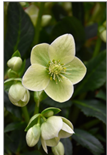
Ice Breaker Corsica Hellebore flowers