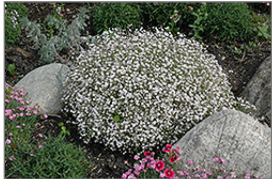
Creeping Baby's Breath in bloom

Creeping Baby's Breath is recommended for the following landscape applications;