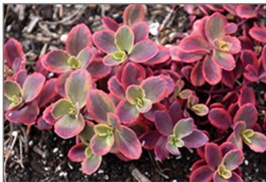
Sunsparkler Wildfire Stonecrop foliage