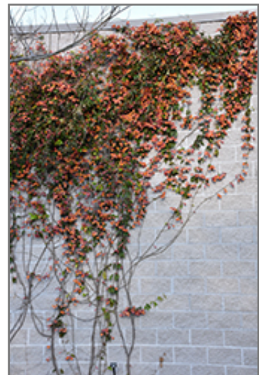
Tangerine Beauty Cross Vine in bloom