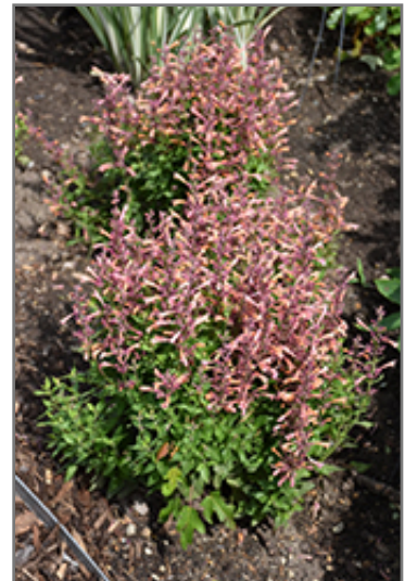
Mango Tango Hyssop in bloom