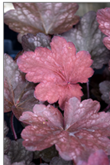
Carnival Candy Apple Coral Bells foliage