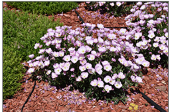
Twilight Evening Primrose in bloom

Twilight Evening Primrose is an herbaceous perennial with a ground-hugging habit of growth. Its medium texture blends into the garden, but can always be balanced by a couple of finer or coarser plants for an effective composition.