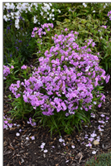
Fashionably Early Princess Garden Phlox in bloom